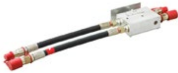
OIL FLOW DIVIDER