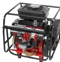
PAC P18 TWIN